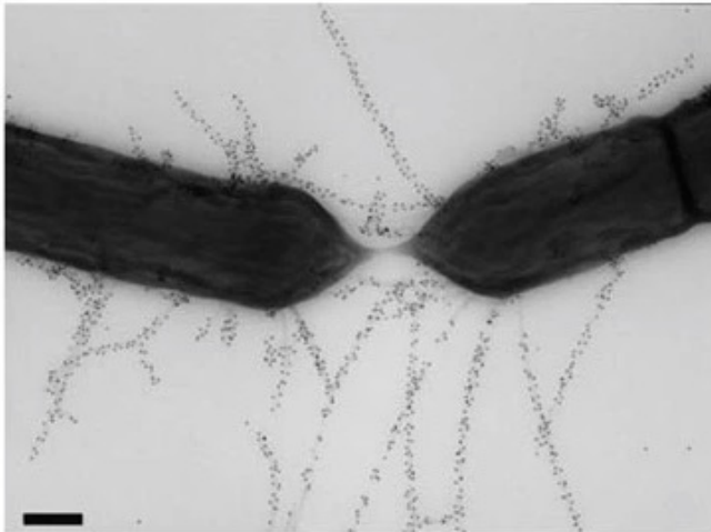
Figure 2: Lactobacillus rhamnosus GG (LGG)-specific pili, not present on other Lactobacillus spp., are involved in the mechanisms of adhesion to the intestinal mucosa. In addition, the pili facilitate a close interaction between the host and the bacteria or bacteria with each other. In this image, transmission electron microscopy reveals pili on LGG cells.

within these areas, such as urinary tract infections (UTIs) and dental caries.